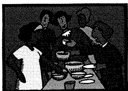
The Colony Inn in Amana was the site of our fall banquet.

Thirty people attended the CVIDS dinner held at the Colony Inn in Main Amana on November 11th. Conversation at each of the four tables was interesting and enjoyable, as evidenced by the decibel level at the beginning of the meeting. Everyone also enjoyed the meal, as evidenced by how quiet it became once the food arrived.