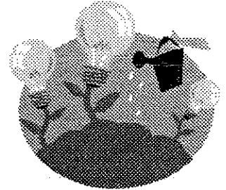
Some ideas grew at our officer's meeting.

plants and having the spring sale. Please attend! We will also need a treasurer's report so we know how much money we have.